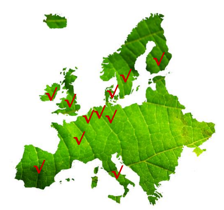
Figure 2. A map showing the countries of the eleven SCAR SWG members who responded to the questionnaire.

As background information we first describe the main regulatory context for biomass and present some voluntary certification schemes.