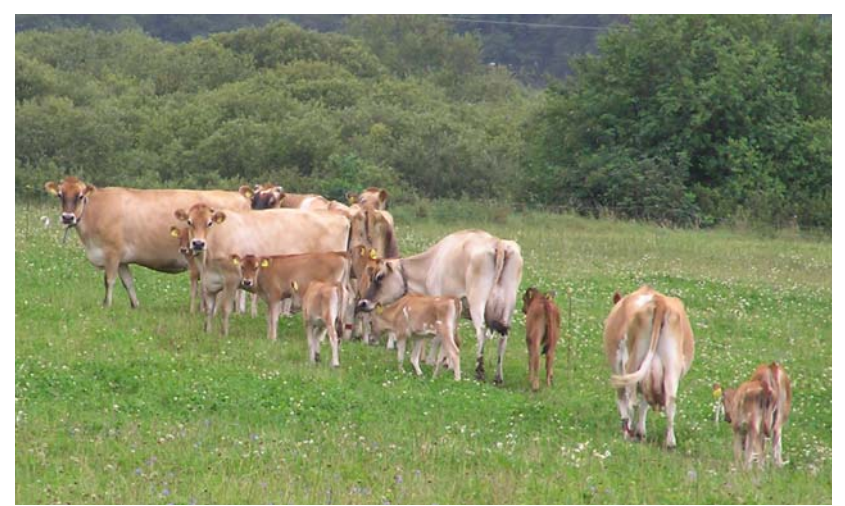
Figure 5. The farmer groups worked with many un-traditional systems and ideas, such as the so-called 'suckler aunt systems', outdoor access during winter, and lot of small innovative improvements that the fellow farmers never would have been advised to do by 'traditional advisors'.

Said by a Stable School participant, summer 2005, Focus Group interview.