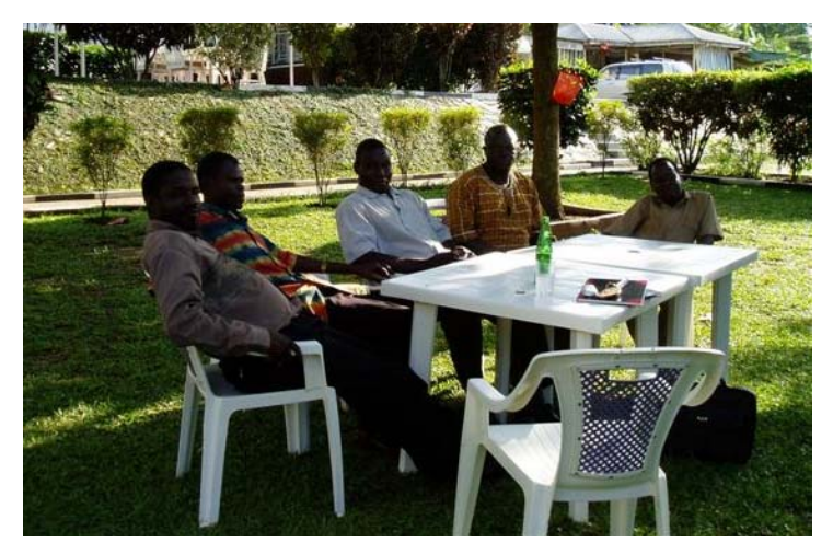
Figure 1. Five facilitators in the hotel garden where one of the focus group interviews took place.

Another method used was the focus group interview. These focus group interviews comprise interview methodologies where groups of people are interviewed (Lewis, 2000). In group interviews, common reflection, exchange of experience and elaborating interpretations or future perspectives are allowed. Such interviews were carried out in the four Danish Stable Schools and in two groups of facilitators in Mbale and Sironko, at a time where all facilitators had been facilitating at least 10 farmer group meetings. Each of these Ugandan focus group interview took approx. two hours and consisted of the facilitators' stories about their experiences in the farmer groups, common reflections on the process within the farmer groups, their own experience as facilitators, their perception of main issues in the improvement of livestock health and production in the area, their needs in terms of education and knowledge about facilitation and their point of views on relevant changes when introducing farmer groups.