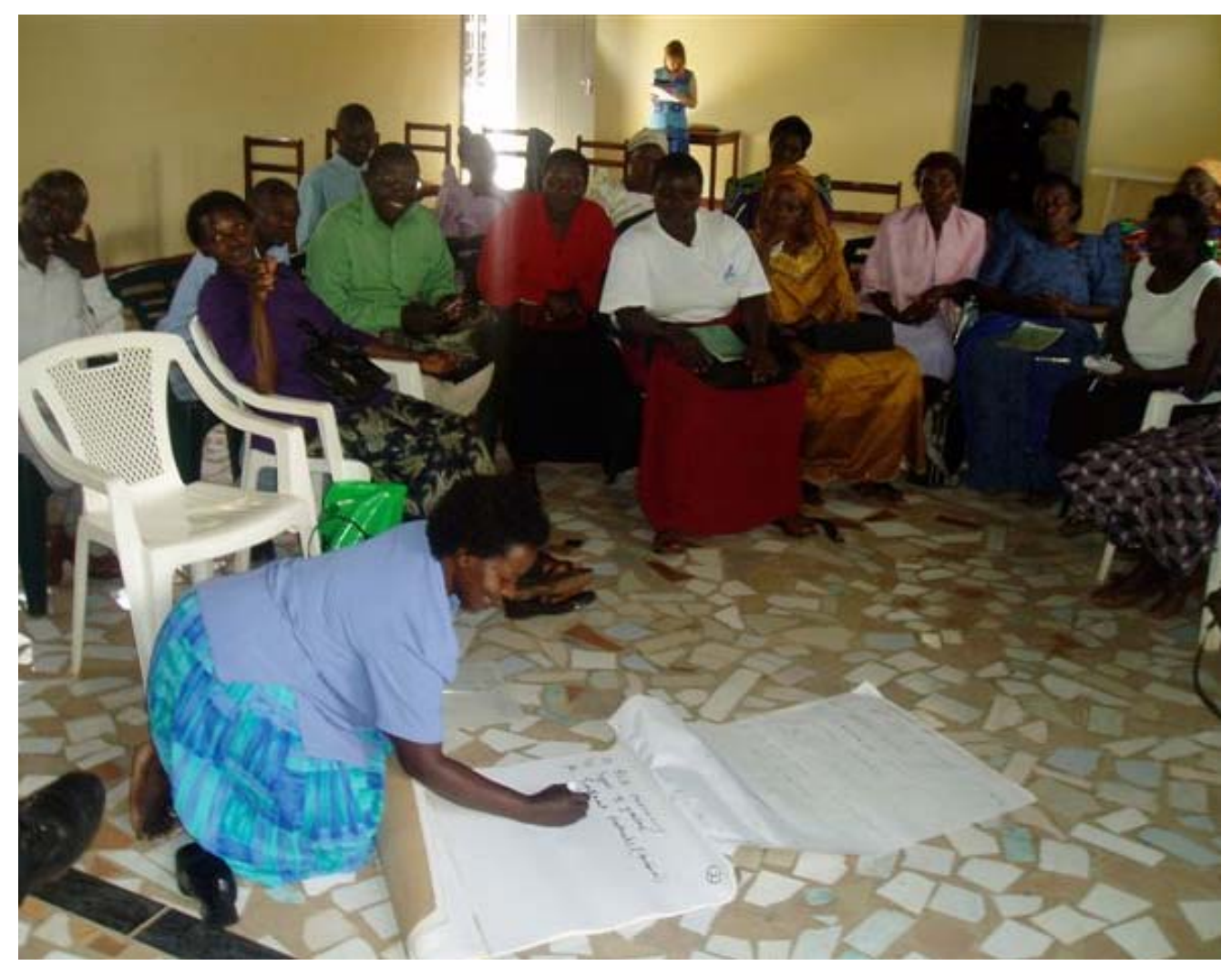
Figure 2. Evaluation workshops were held in the farmer groups at the end of the project, where farmers discussed the outcomes and process of participating in the farmer groups.

Participatory Impact Assessment workshops and evaluation workshops. Two PIA workshops were conducted by two experienced facilitators, following the method described by Oruko et al. (2003). One was held in Jinja municipality combining the urban and peri-urban farmers from the project, and the other one in Butagaya with the rural farmers. The Participatory Impact Assessment (P.I.A.) is a widely used method of assessing impact among a group of participants in client-oriented research and dissemination projects (Jackson & Kassam, 1998). The P.I.A. process is directed towards ranging the major impacts on household and community level as perceived by the participants, and identifying potential risks and relevant action to the achieved impact.