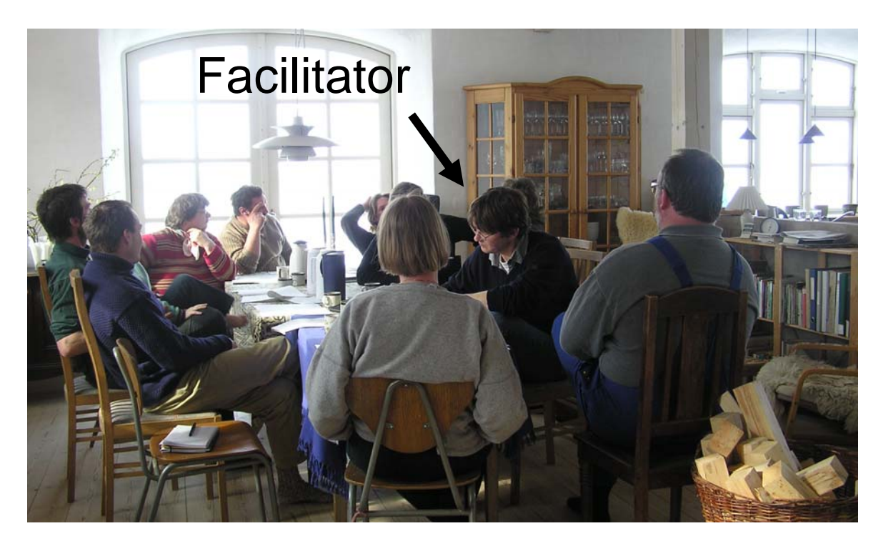
Figure 3. During the meetings, the facilitator is the person keeping the structure of the meetings, keeping track of time, keeping the group to the agenda, and writing the minutes from the meeting, which will be sent out together with the agenda to the following meeting.