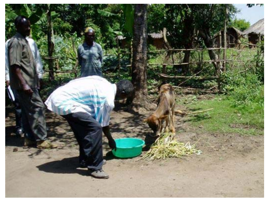
Figure 3. The farmer fed the calf after advice from the group. In this way, it was clearly visible to everybody that the calf was hungry instead of in need of medicine.

It was hot, even though we met at around 10 o'clock in the morning. The farmer group members greeted each other and sat down in a circle in the shade under a tree talking for about 30 minutes about this farm, including the daily practices. After this, the group examined the two cows, which were tethered left standing under the burning sun. When the facilitator attempted to close the meeting, the farmer asked for a bit more time, because he had a calf he wished to show the group. We had so far only focused on the cows. He thought that the calf was ill and needed medicine. He brought the calf forward. The calf was grinding its teeth and looked very depressed. The bones were clearly visible under the very dry skin, and there were clear signs of dehydration. The group concluded that it was very skinny, but nobody could really tell what was wrong. Until now, the calf had never been offered water or any other feed than milk from the mother (assumed very sparse) and what it could find itself. The facilitator emphasised the fact of even a young animal's need for supplement both in terms of feed and water and encouraged the group participants to look around on the farm for appropriate supplement feed for calves, and advised the farmer to feed his calf left over beans and water right away.