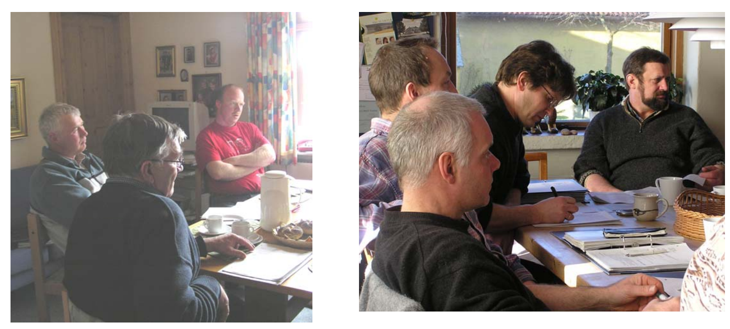
Figure 2 a & b. After having seen all outdoor facilities and all groups of animals, the group goes indoors and after a cup of coffee and 'free talk' they start working by going systematically through the agenda.