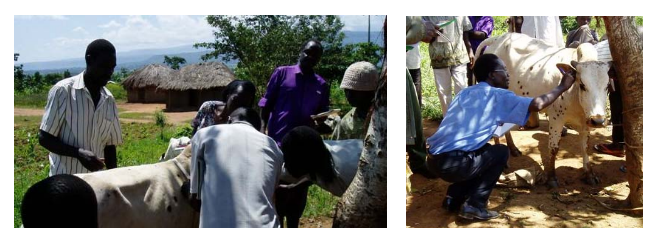
Figure 5a. Farmers estimating the weight of the cow by measuring it (heart girth).